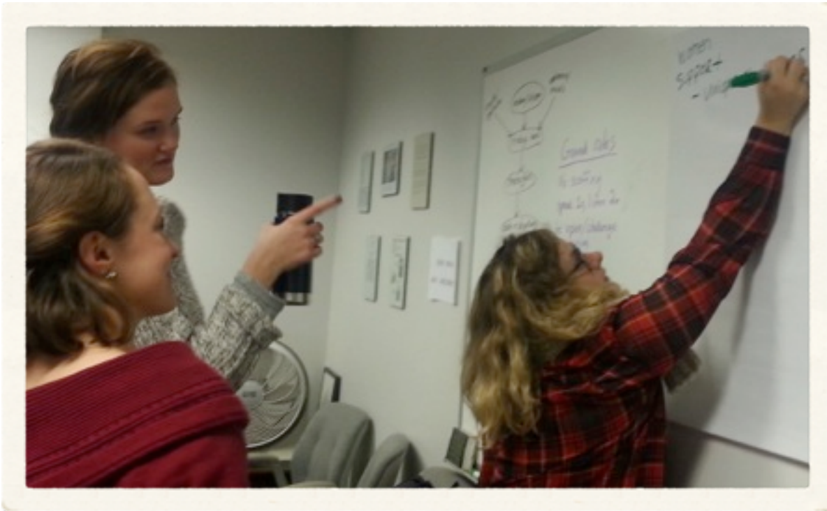
WFAN board members hard at work on an updated strategic plan.